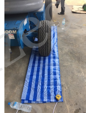
Move boom lift to the center of the sheet