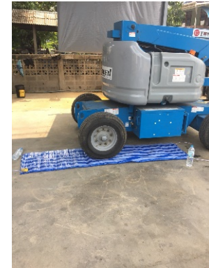
Middle position as shown