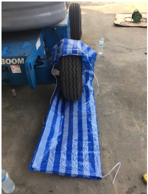
Bring a sheet to cover the tire