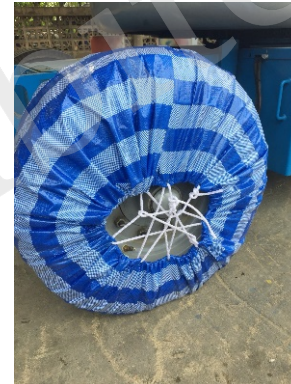
Tie as tight as possible like a star shape