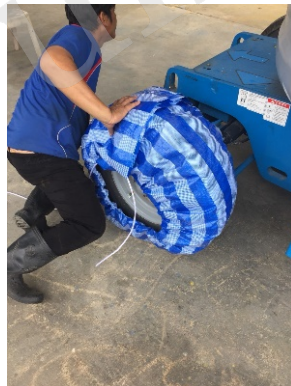
Make holes in the sheet so that you can tighten the sheet