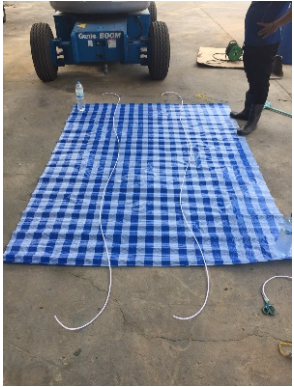
Cut the length 2.5m