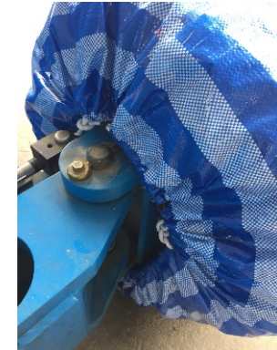
On the back side, tie loosely so that wheel can go around smoothly