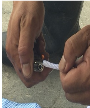
Prepare 2 ropes 3.5m /each, treat the edge with lighter