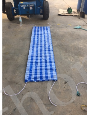
Fold in three and each width 60cm and put two ropes though inside